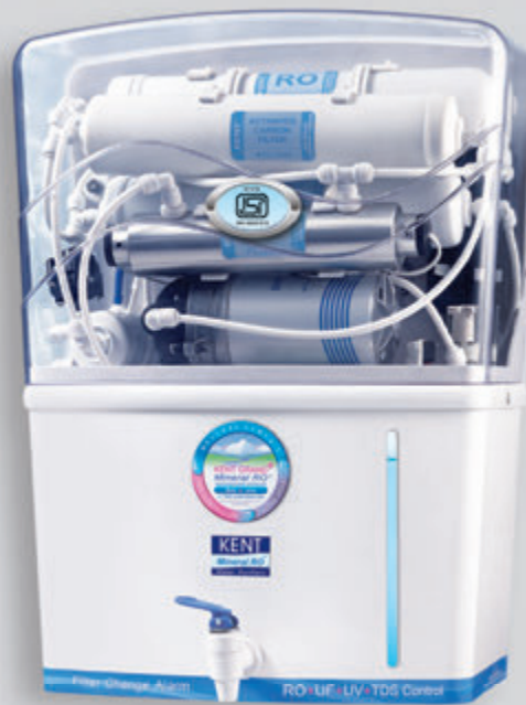
Wall mounted RO water purifier

Give your family 100% Safe & Tasty Water